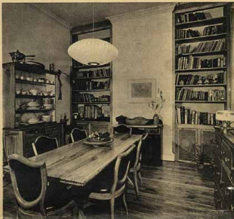
Bookshelves were added in the dining room, which centers around a Canadian pine farm table and dining chairs of maple with black leather seats and backs. The vestment chest from a Canadian convent, at right of picture, holds table linen.